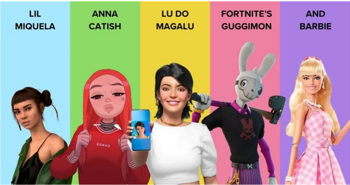
Demand for entertainment, culture and education drives the need for brand ambassadors. Virtual influencers will soon occupy this space

This new wave of influencer marketing uses expert knowledge through short-form videos to generate followers and fill scrollable moments.