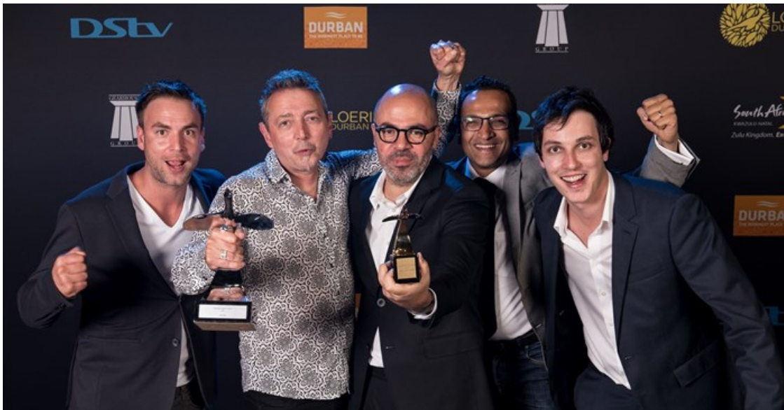
Impact BBDO MEA, Regional Agency Group of the Year at Loeries 2017.

This brought the total presented to 241 with 5 Grand Prix out of more than 3,000 entries for 800 brands, represented by 400 agencies from 18 countries across Africa and the Middle East.