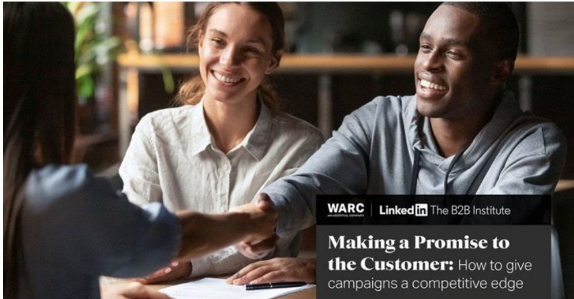
Key findings of the whitepaper, Making a Promise to the Customer: How to give campaigns a competitive edge was presented at Cannes Lions