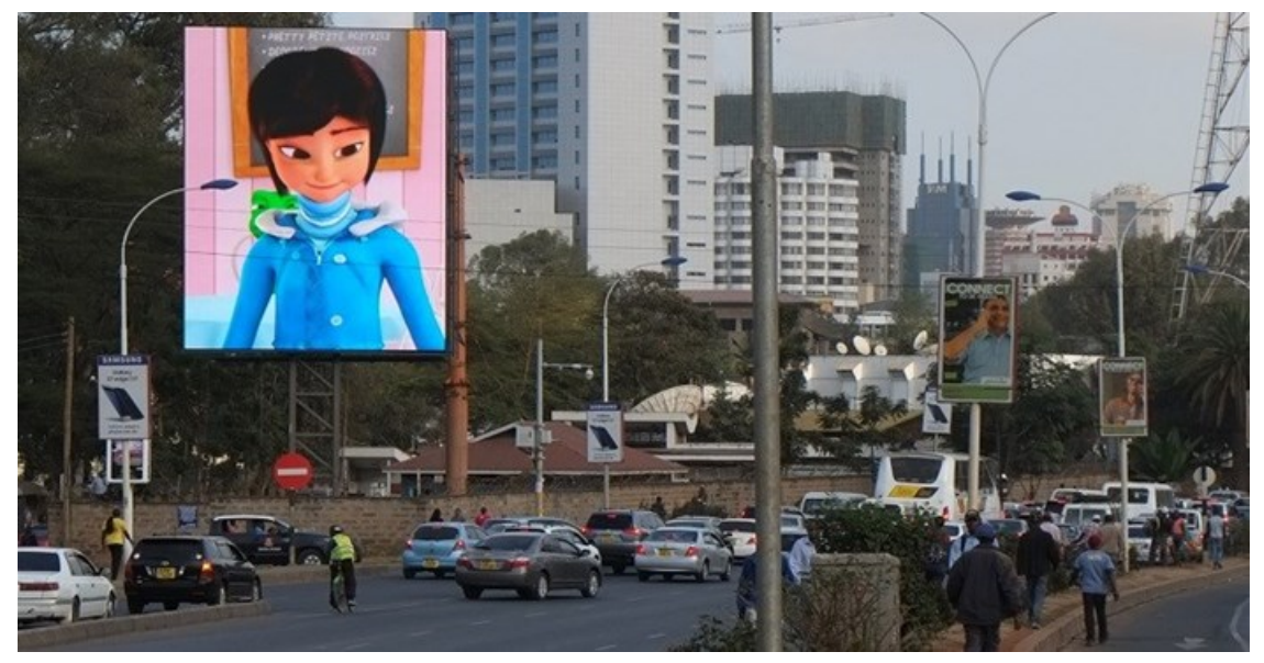
Primedia OOH Africa

Primedia OOH Africa recently launched a new Super-LED screen in the heart of Nairobi, Kenya's capital city and the economic hub of East Africa.