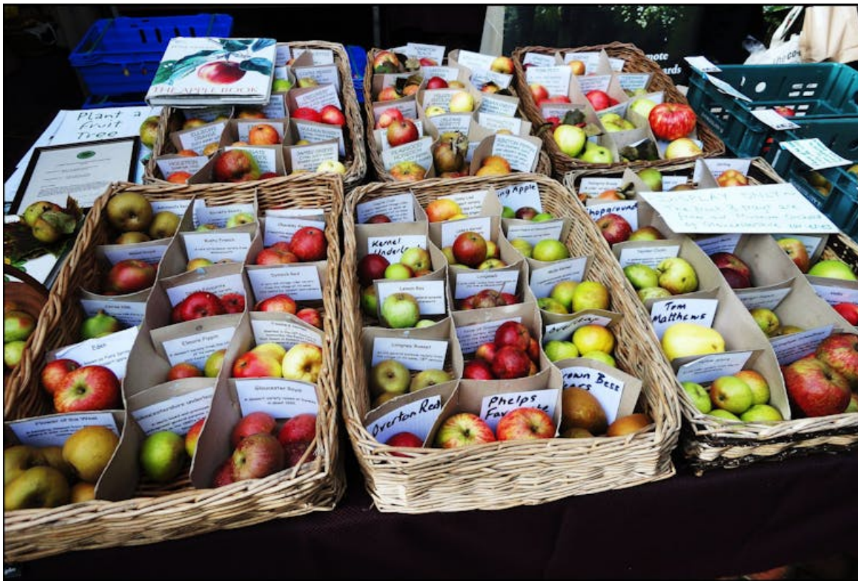
Heirloom apples, Stroud Farmers Market, Gloucestershire, England.