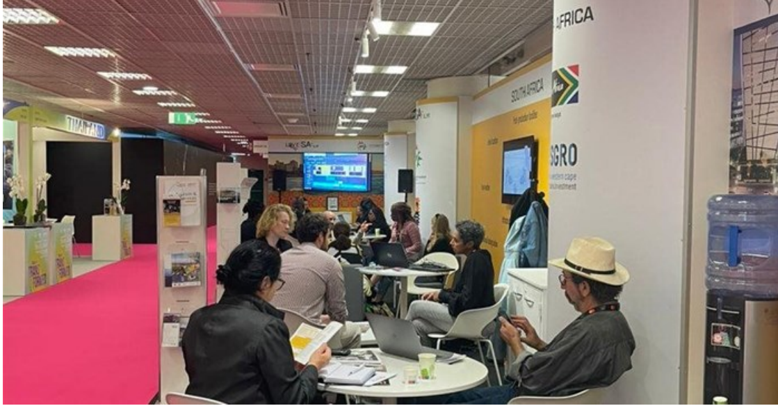
Image supplied. The(NFVF is positioning the South African film industry at the 76th edition of the Festival de Cannes, from 16 to 27 May 2023

The National Film and Video Foundation (NFVF) has funded eight South African filmmakers to participate at this year's Cannes Film Festival for film screenings, panel sessions, and project pitching opportunities.