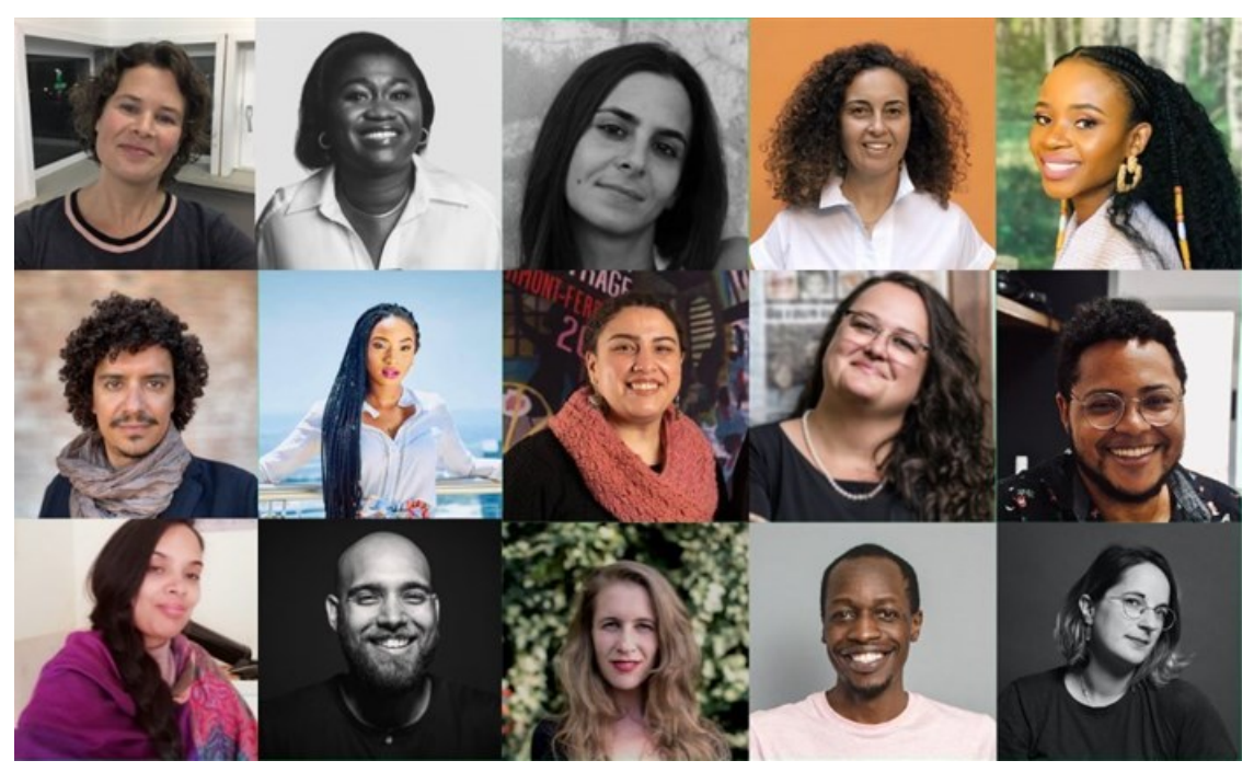
Image supplied: The selected producers for the Creative Producer Indaba

15 diverse producers from around the globe have been selected to participate in the second Creative Producer Indaba (CPI).