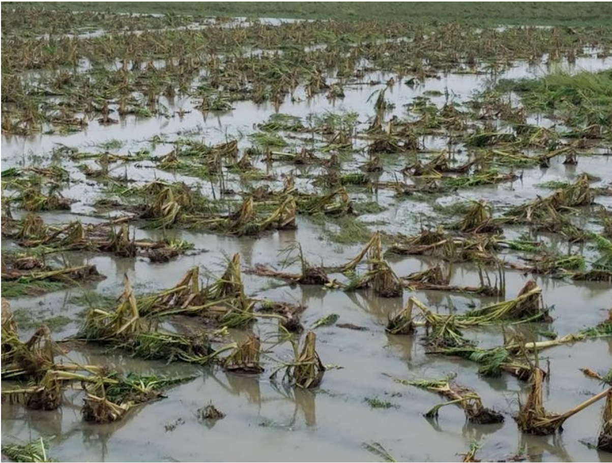
Crop damage on Puerto Rico from Hurricane Maria, Oct. 3, 2017.