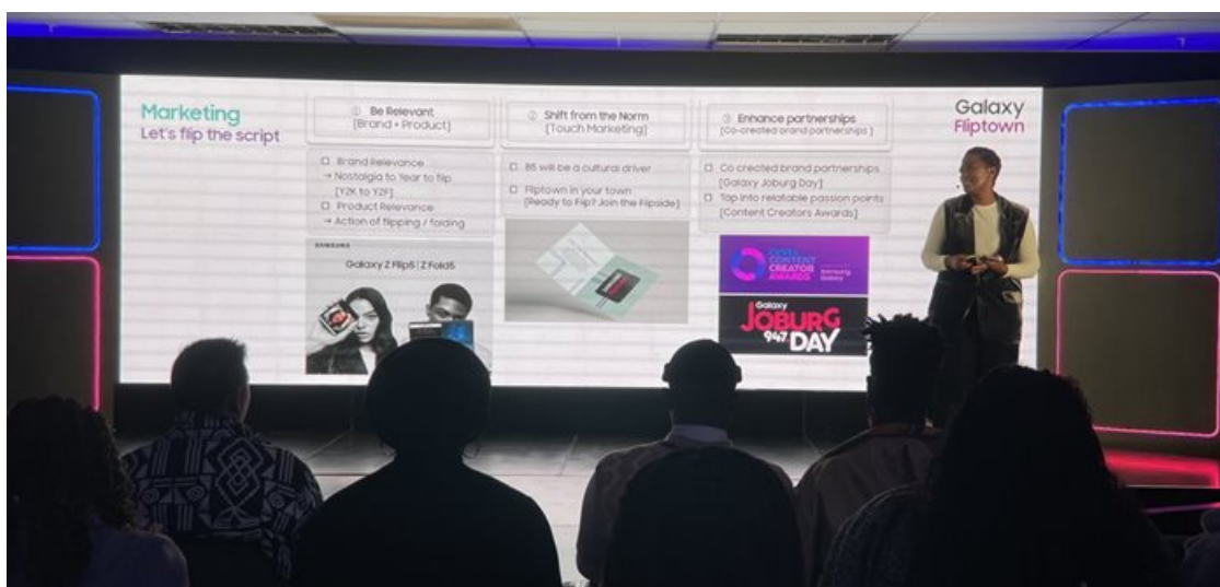
Samsung South Africa Galaxy Z Flip5 brand positioning.

"We welcome the competition because it brings more legitimacy to the foldables category," concludes Hume.