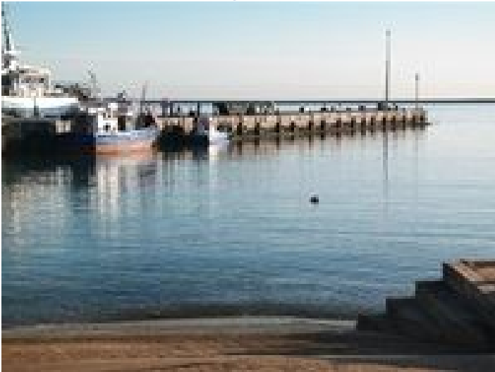
Hop on a catamaran from the Algoa Bay Yacht Club.