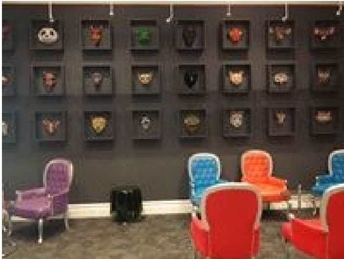
The Athenaeum is home to Nelson Mandela Bay's creative industries.