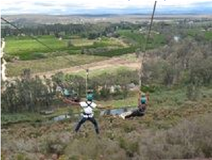
Double ziplining at Adrenalin Addo