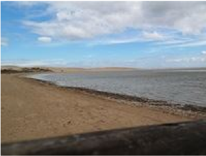
The Alexandria Dunefields cover 142km of ground on the Sunshine Coast.