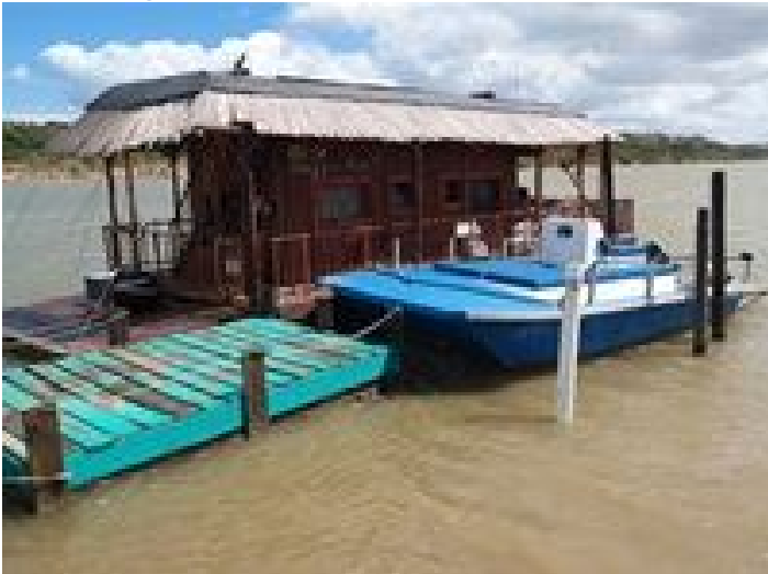
The Maggie May Party Boat cruises along the Sundays River.