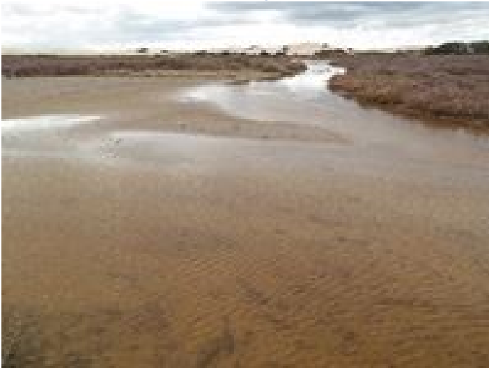
The Alexandria Dunefields are the largest in the southern hemisphere.