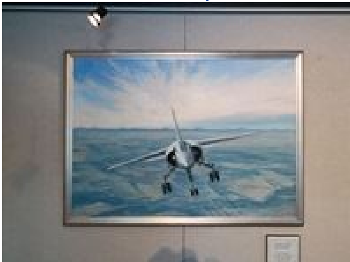
GFI Art Gallery houses the Ron Belling Aviation Collection.

For more, visit: https://www.bizcommunity.com