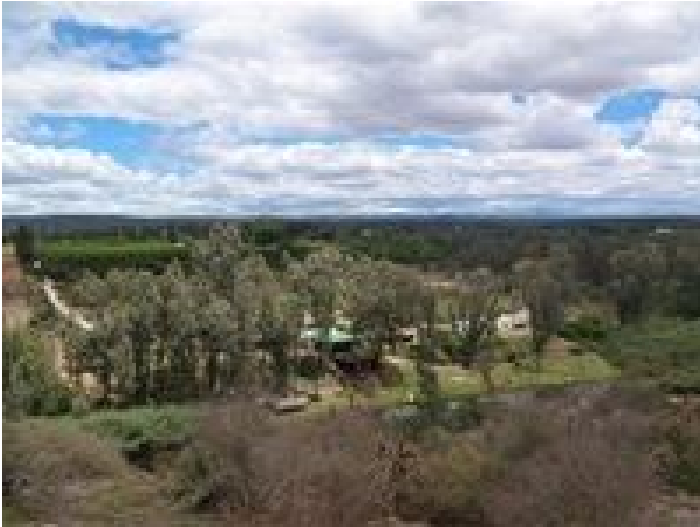
Adrenalin Addo is situated in the heart of Sundays River Valley.

Bizcommunity's whirlwind tour of what Nelson Mandela Bay has to offer domestic and international travellers included a trip to Adrenalin Addo, situated in the heart of Sundays River Valley, a drive out to the impressive Alexandria Dunefields where one can give sandboarding a go, a leisurely trip around Algoa Bay with Stampede Cruises, and a taste of the arts and culture scene in the city with stops at the Tramways Building, The Athenaeum, and GFI Art Gallery.