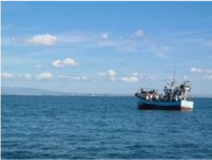
Surf, rock and deep-sea angling opportunities are available.