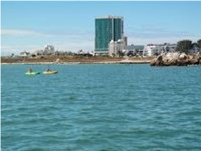
Kayaking at Hobie Beach