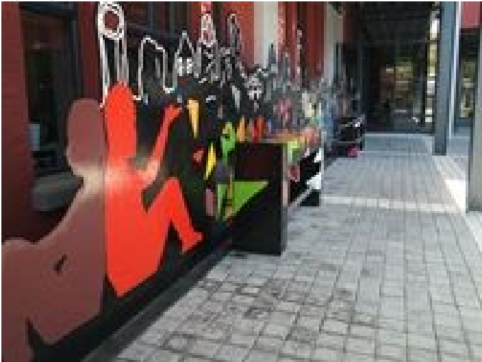
Artwork at the renovated Tramways Building