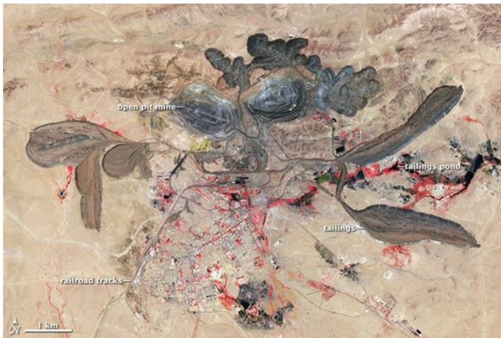
Satellite image of the Bayan Obo mine in China, taken on June 30, 2006. Vegetation appears in red, grassland is light brown, rocks are black and the water surfaces are green.

The digital economy is accelerating faster than the actions being taken in the green economy movement to counter negative environmental impacts. To move forward fast, we must first start thinking differently.