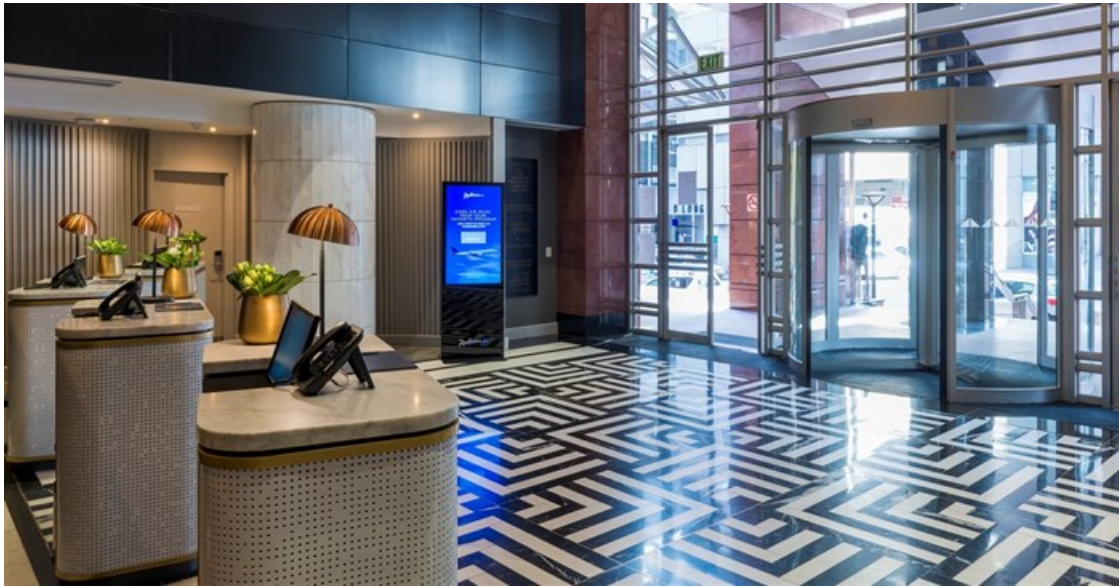
Lobby of Radisson Blu Hotel & Residence Cape Town

■ Radisson Blu Hotel & Residence is set to open its doors in April 2017. Are you ready? Have you had any interest ahead of the opening?