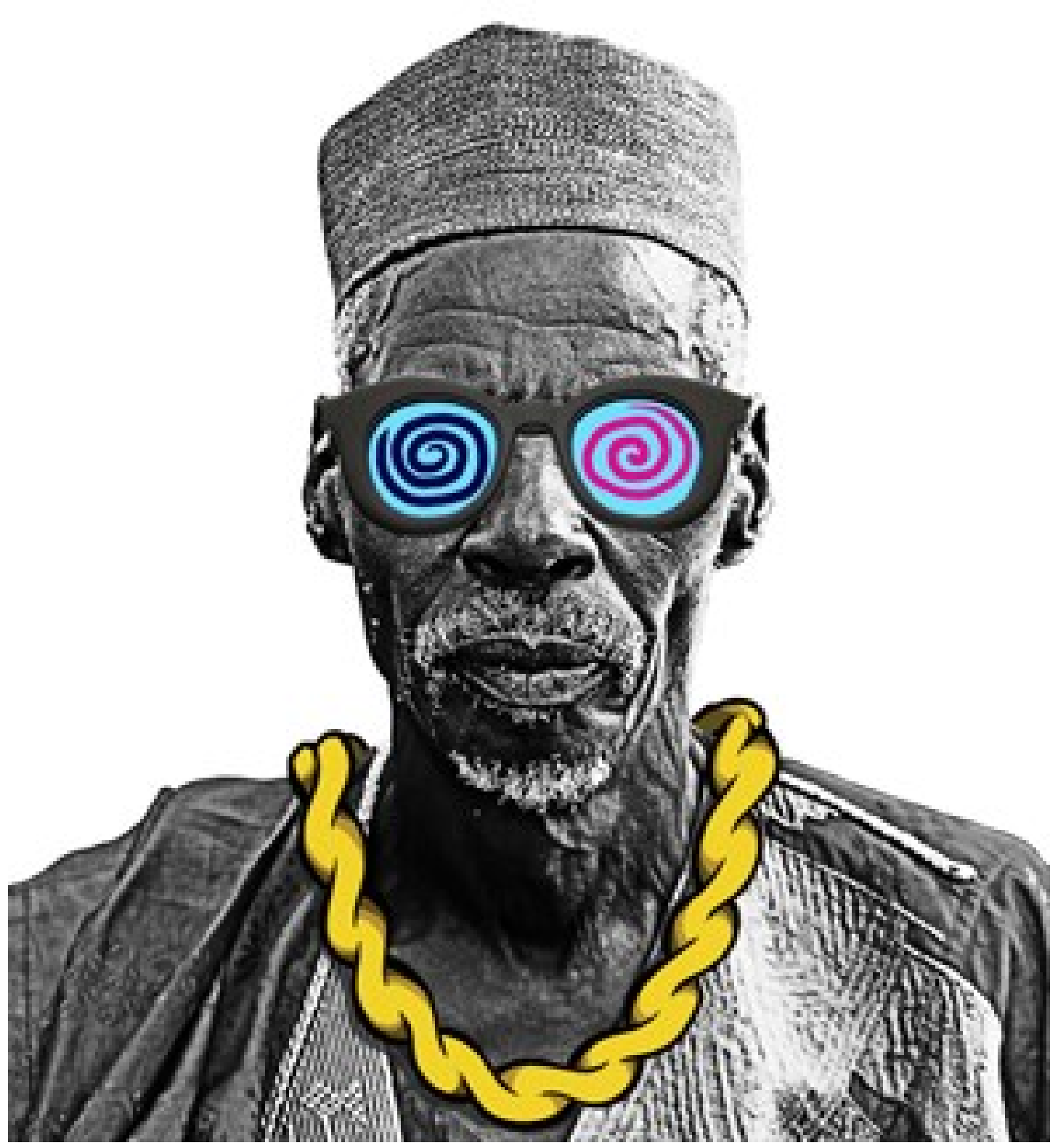
Williams Chechet - Disconnect

Either way, the African galleries represented at Investec Cape Town Art Fair include Afriart Gallery of Kampala, Nairobi's Circle Art Gallery, Espaco Luanda Arte, First Floor Gallery of Harare, Louis Simone Guirandou Gallery of Abidjan, Omenka Gallery of Lagos and This is not a White Cube also from Luanda. These, as well as galleries from Western Centres specialising in African contemporary art, will no doubt pay homage to, and benefit from, the current zeitgeist .