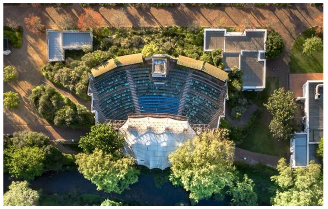
The 2021 Jazz & Classical Encounters Festival will take place at the Spier Amphitheatre in Stellenbosch.