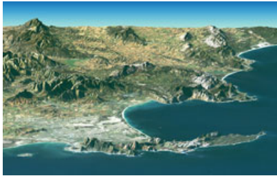
The people of the Western Cape have a right to know what impact e-tolling will have on their lives.

In the meantime, the hearings will continue in secret.