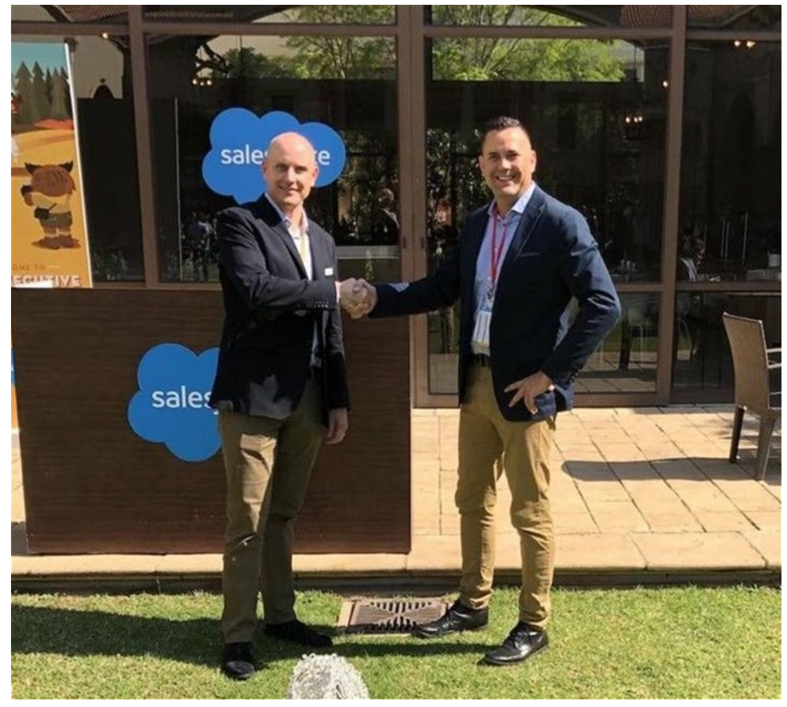
Salesforce, SharpSpring, and Rocketseed are V5 Digital's global customer success leaders