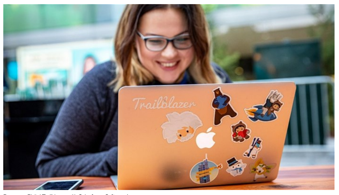
Become a Digital Trailblazer with Salesforce Software!

Salesforce Marketing Cloud users span many industries and company sizes and while it is mainly considered an enterprise-level platform, its different editions make it flexible enough for any organisation, including yours!