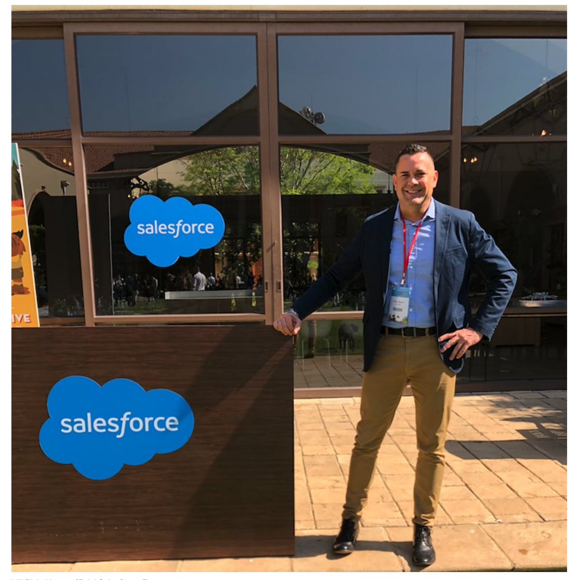
V5 Digital is an official Salesforce Partner

V5 Digital has been a proud <u>Salesforce</u> consulting partner since 2020, dedicated to helping companies in Africa and beyond unlock the full potential of their Salesforce investment. Our team is armed with the knowledge and experience to help businesses set up and optimise their use of Salesforce and in so doing, drive business growth.