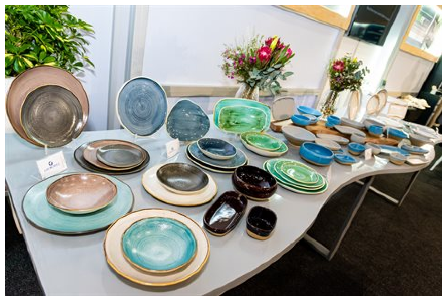
BCE at Hostex

With a 38-year legacy of fostering industry connections, Hostex is poised to once again showcase innovation in every aisle. Over 70 exhibitors will present their product ranges and services, finely tuned to meet the evolving needs of a dynamic industry primed for growth. Among them are a variety of first-time exhibitors and leading companies with new product launches promising cutting-edge solutions waiting to be discovered. Among the top brands exhibiting at Hostex 2024 are Adriatic, Core Catering, FoodServ Solutions, BCE, Morrico, Vulcan Catering & Bakery Equipment and Koldserve/Equipment Café.