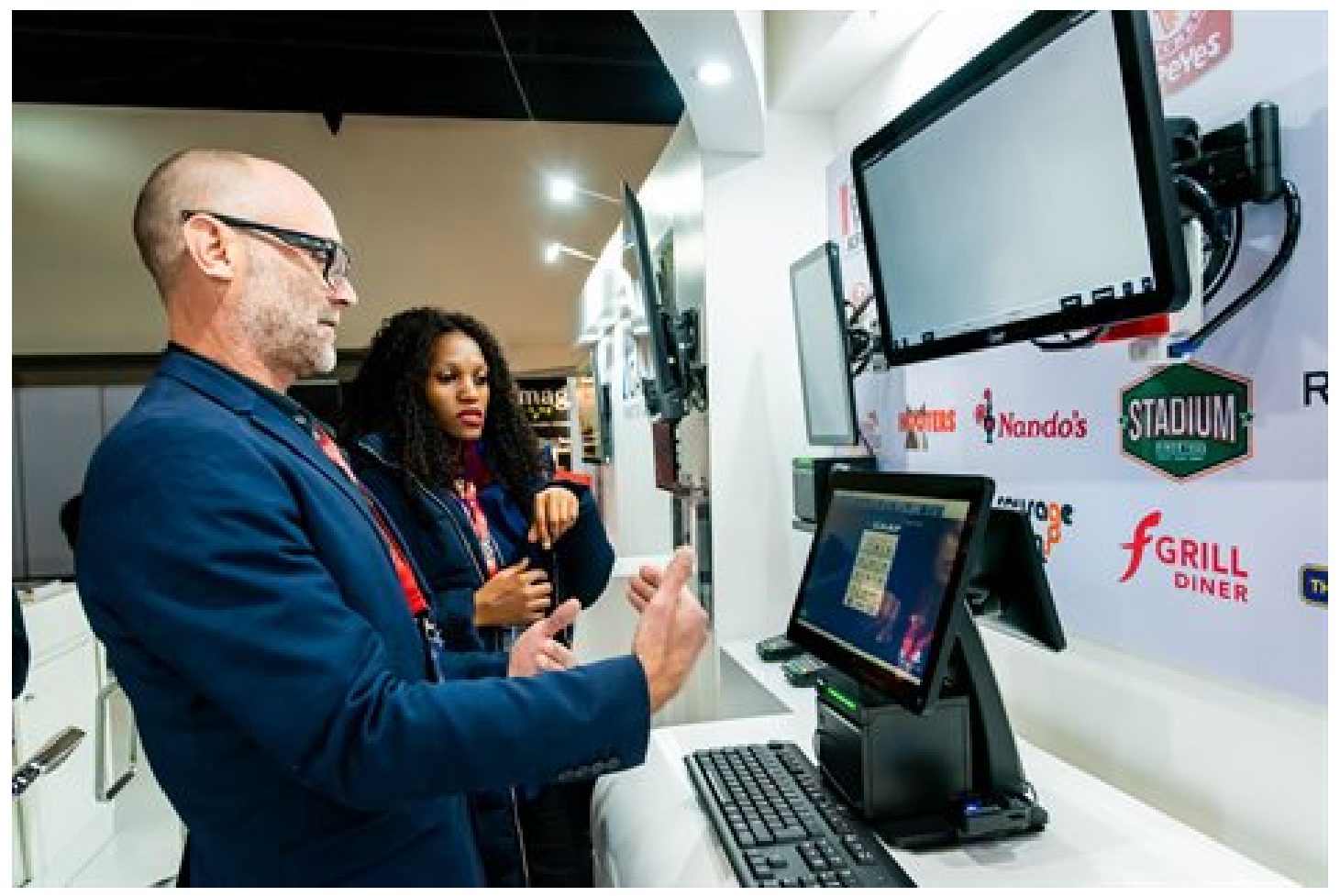
GAAP at Hostex

Renowned as a launchpad for new products, Hostex visitors will be greeted by an array of innovations. These and other