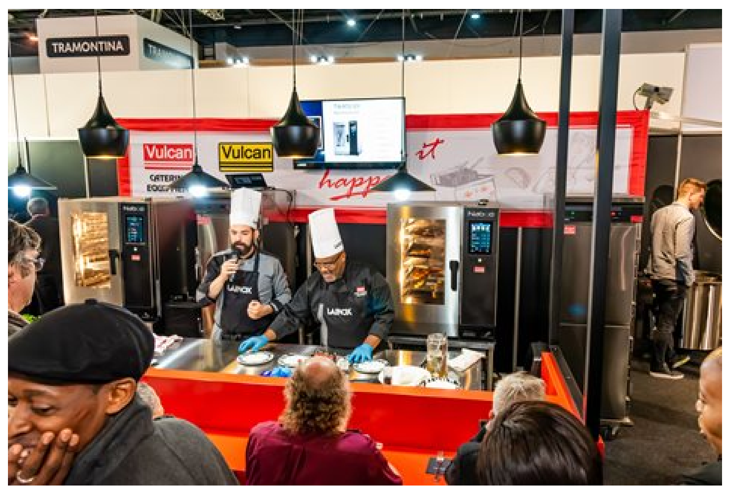
Vulcan Catering & Bakery Equipment at Hostex

Hostex 2024 promises several highlights: