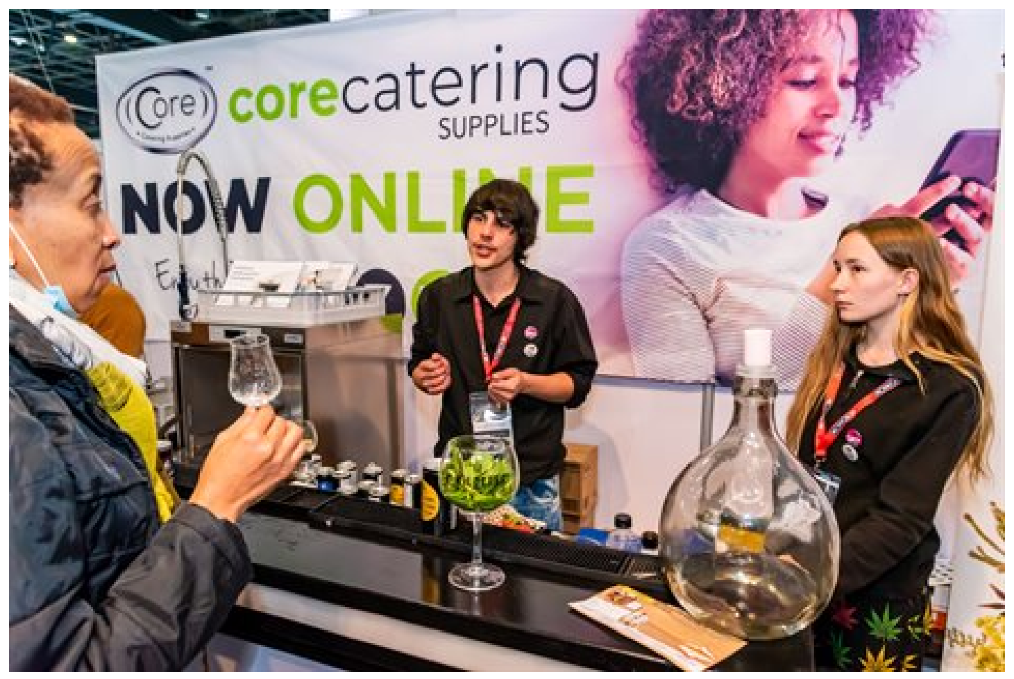
Core Catering at Hostex