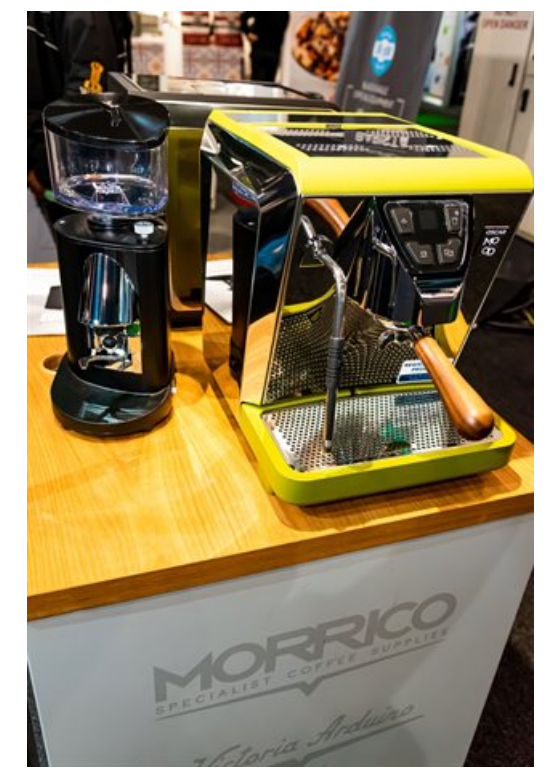
Morrico at Hostex