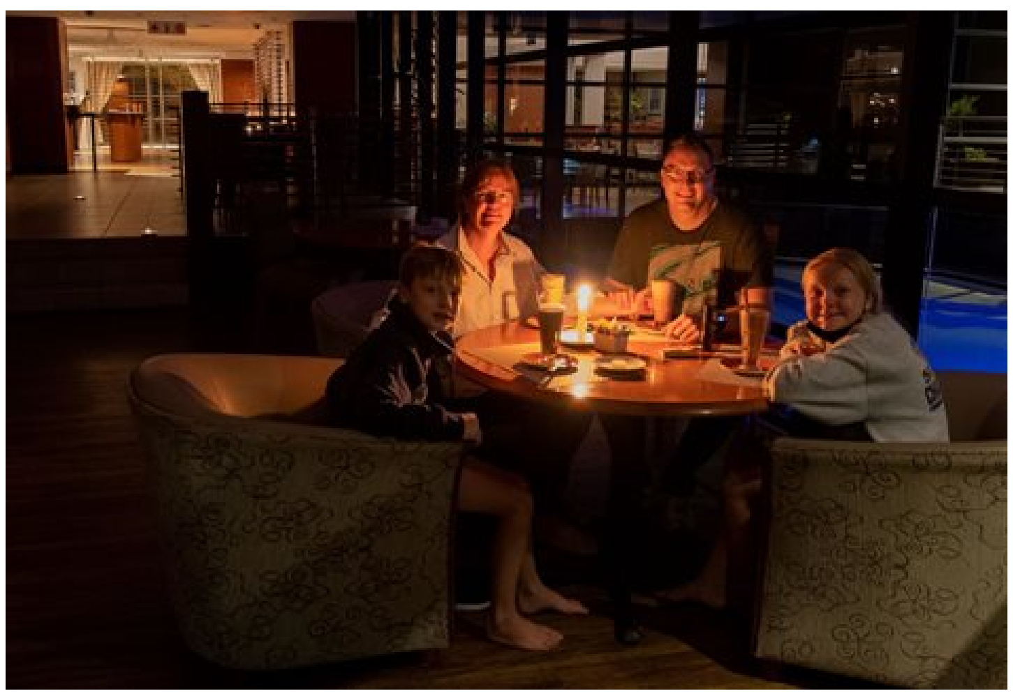
Hot chocolate at City Lodge Hotel at Ortia, Earth Hour 2022