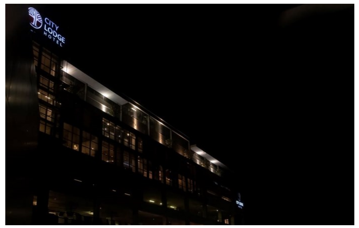
Oty Lodge Hotel at Ortia, Earth Hour 2022

When you take part in Earth Hour, you are joining likeminded people from around the world. Organised by the World Wide Fund for Nature (WWF), this initiative encourages individuals, communities, corporates and households to turn off their lights for one hour from 8:30pm to 9:30pm on the last Saturday of March, in support of and to raise awareness for the need to protect nature and tackle the climate crisis.