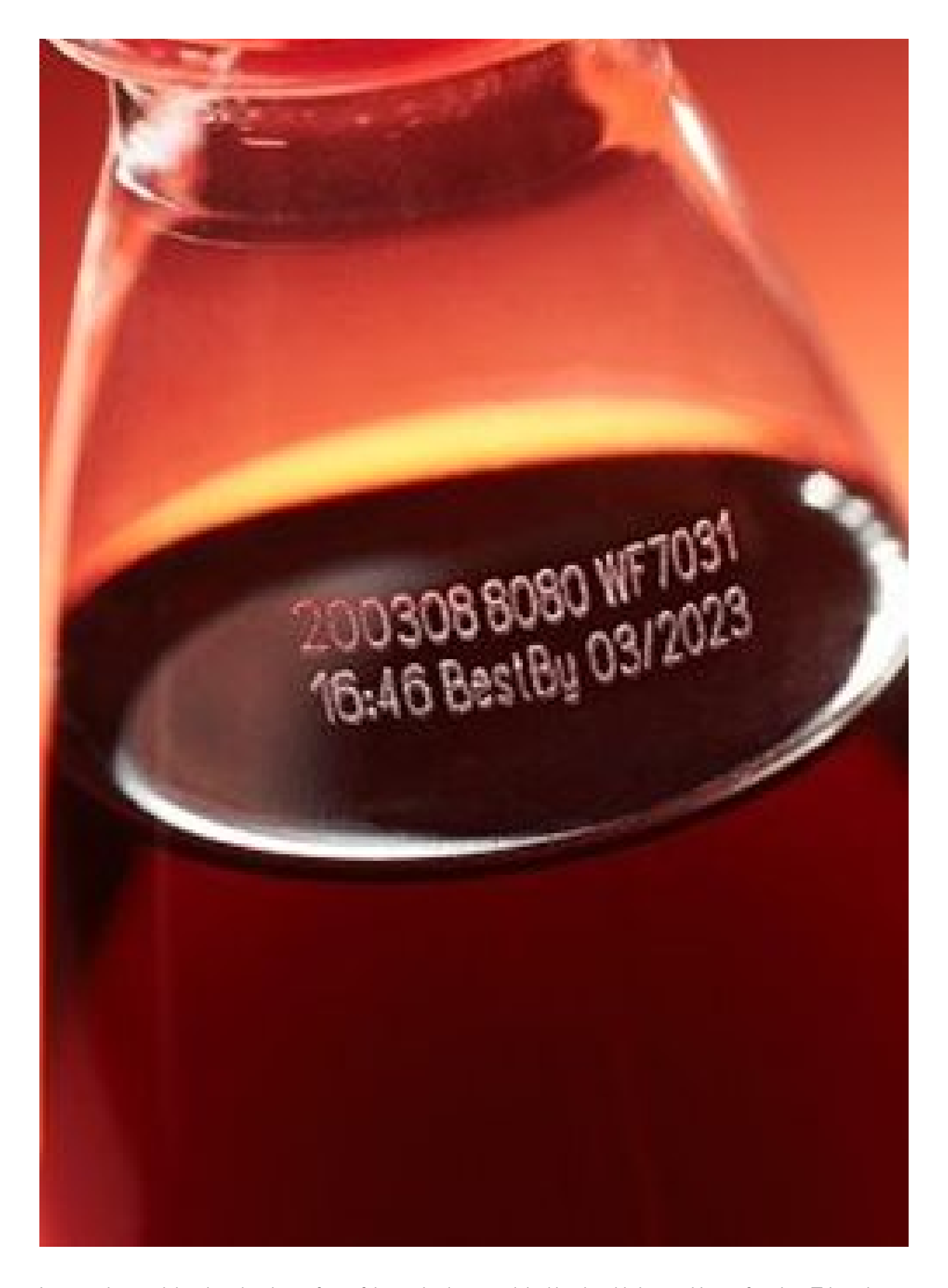
Laser coders work by changing the surface of the packaging material, either by ablation, etching or foaming. This makes