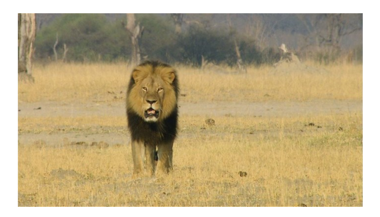
Cecil: The Legacy of a King, premieres Sunday, 14 February at 6pm. This incredible special follows the life and legacy of one of the world's most famous lions - Cecil. The ultimate big cat king, Cecil was a warrior, a father and a loyal brother. But his untimely death at the hands of an illegal hunt in Zimbabwe - spelled the end of his extraordinary reign; evoking feelings of fury and sadness to all who hear his tale across the globe.