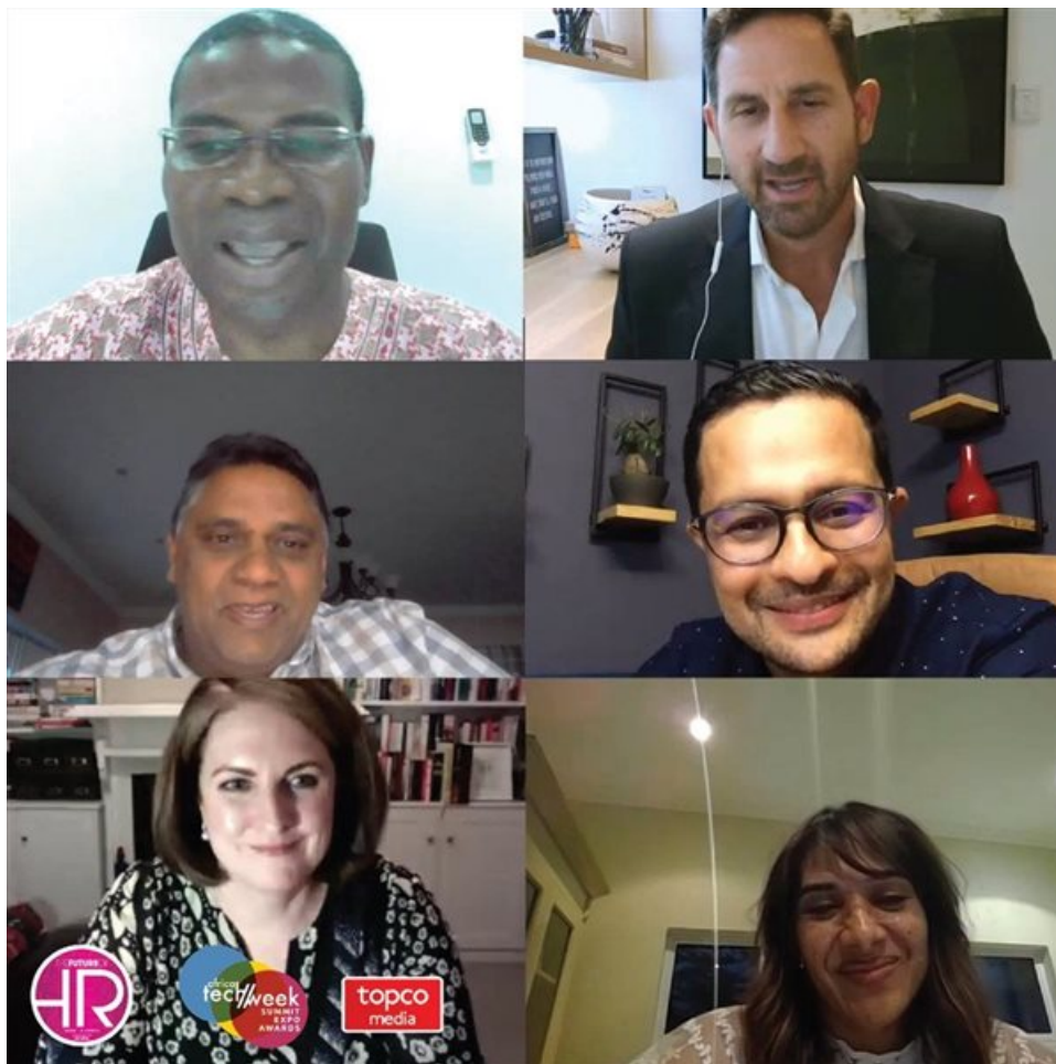
Some of the 2020 Africa Tech Week & Future of HR award winners