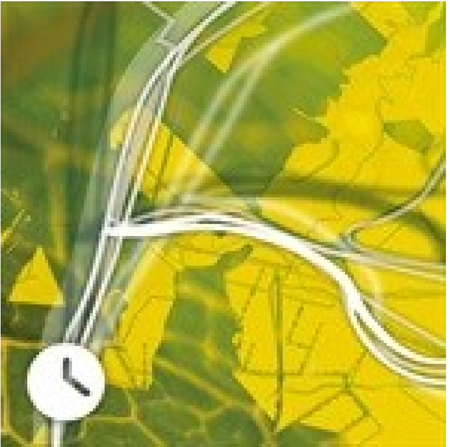
The AfriGIS Unique Identifier helps you to keep track of data changes over time