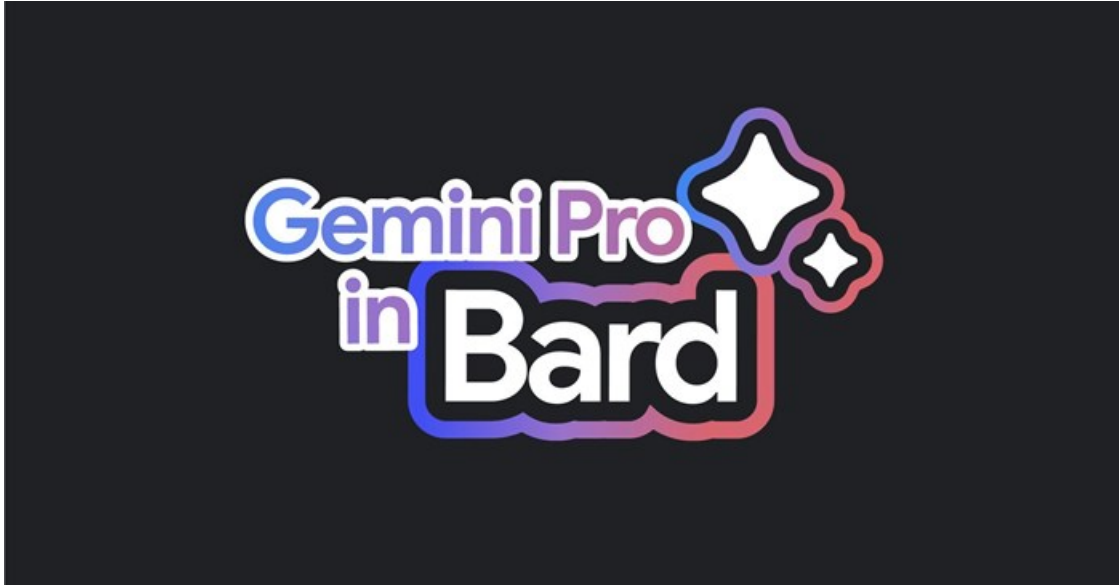
Gemini Pro now powers Google Bard

Google has announced the global expansion of its conversational AI model, Bard, in South Africa. Bard comes to our shores powered by the advanced AI model Gemini Pro and is now accessible in over 40 languages across more than 230 countries and territories.