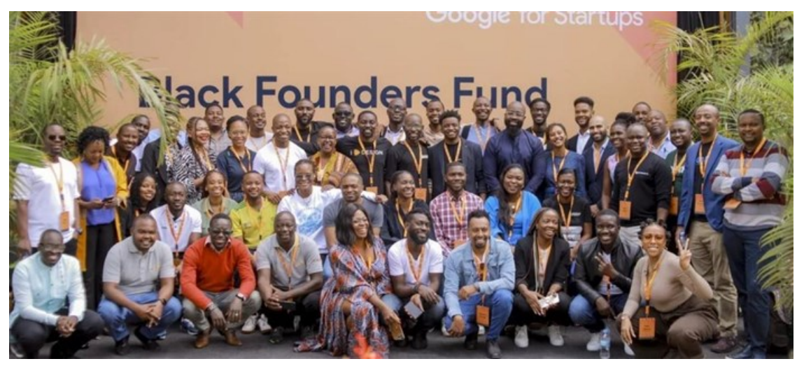
Recipients of the Black Founders Fund 2022

Applications have opened for the third cohort of Google's Black Founders Fund for Startups in Africa and Europe. The company has committed $4m to support eligible Black-founded startups in 2023.