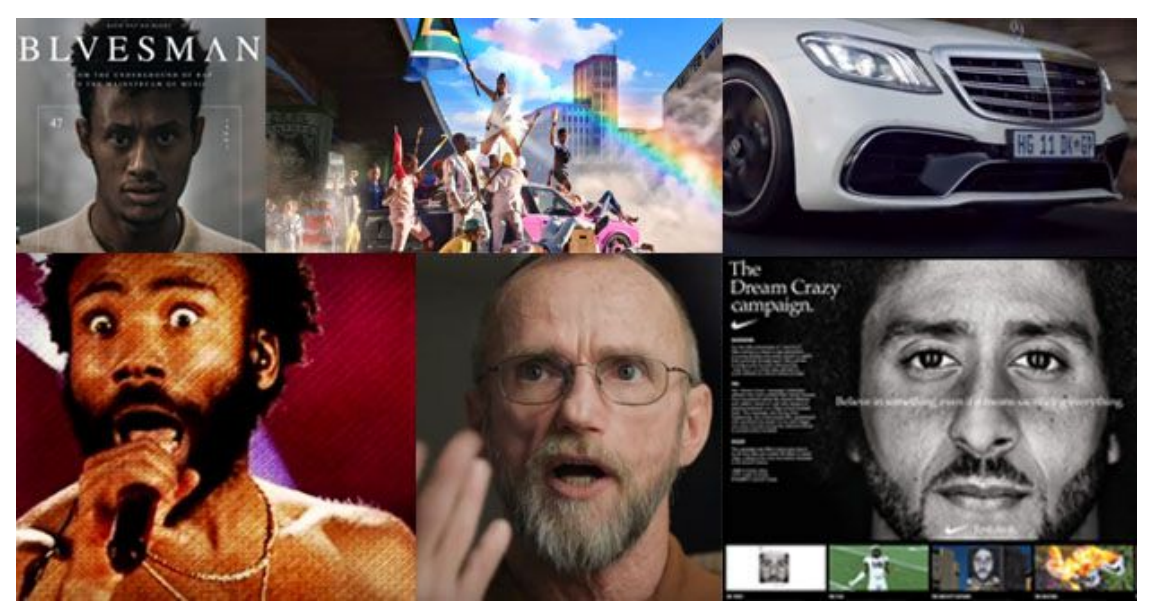
#CannesLions2019 Entertainment winners include VMLY&R and Net#work BBDO!

The 66th annual Cannes Lions Festival of Creativity continued on 18 June, with the 2019 Cannes Entertainment Lions, Entertainment for Music Lions and Entertainment for Sport Lions announced during the Entertainment award track ceremony and SA bringing home two Bronze Lions.