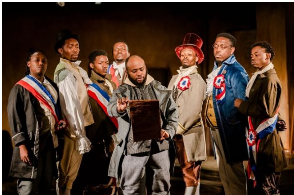
1789 by Sibikwa Arts Centre

dance collectives, in a project called Third Space , to create new works that will be brought to the Festival.