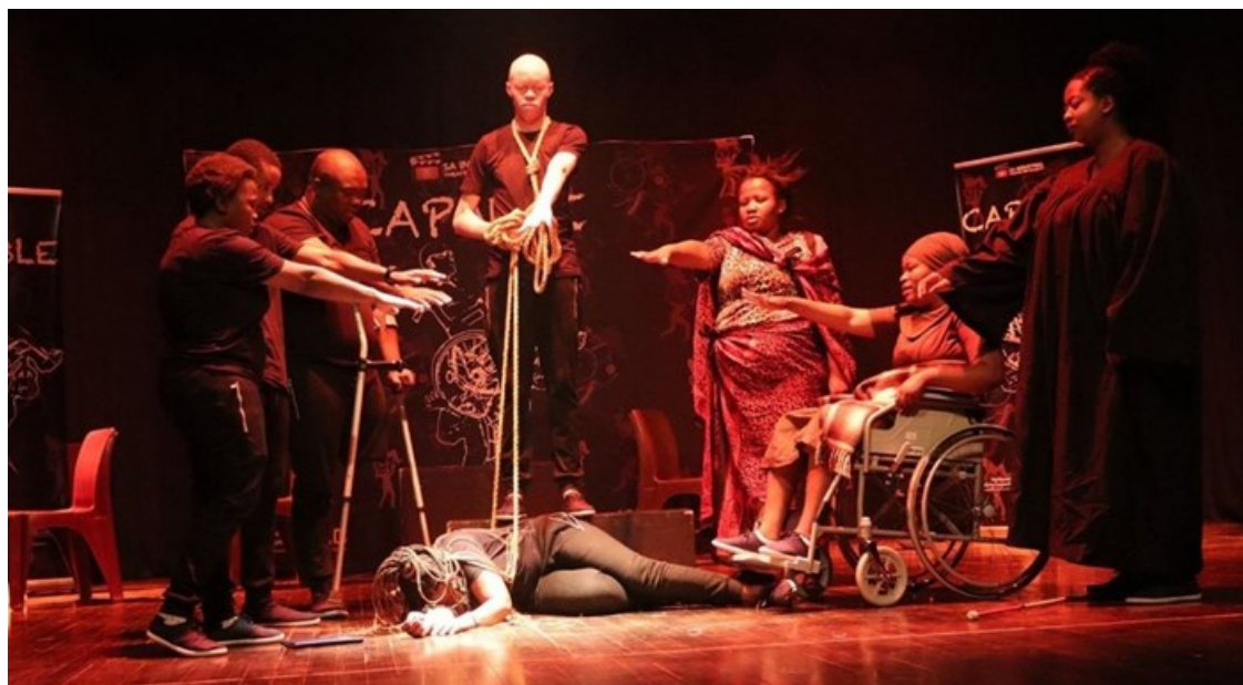
SA Industrial Theatre for Disability presents Capable on the 2024 Fringe programme