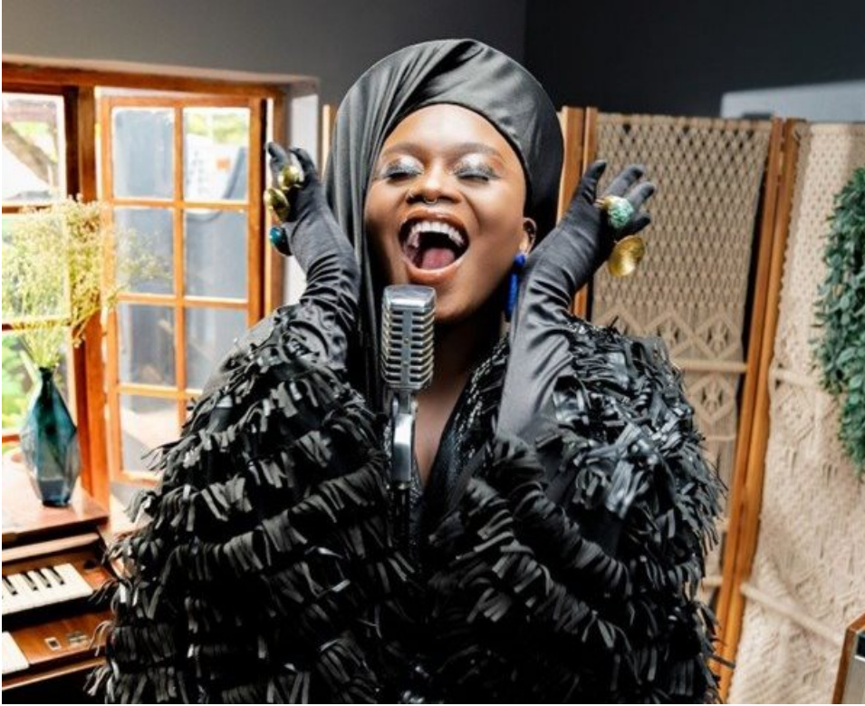
2023 Standard Bank Young Artist for music, Zoë Modiga

The 2024 National Arts Festival programme is live and available for browsing online and booking.