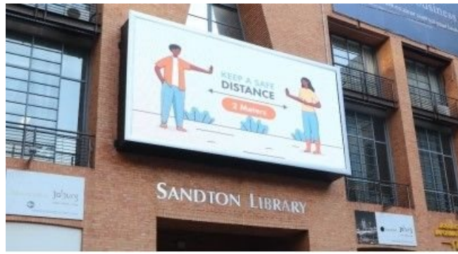
Katherine Street, Sandton

As Kena Outdoor, an entity that prides itself on being innovative and responsive to the demands of the market and the ever-changing circumstances, we are currently working on implementing a solution that will render loadshedding-related outages a thing of the past for our clients. Our solutions look to make use of renewable energy and other resources that will make 24/7 capabilities a reality. It's often in times of great challenges that, great innovations happens. We are excited at the prospect of adapting and continuing to serve our clients even in these uncertain times.