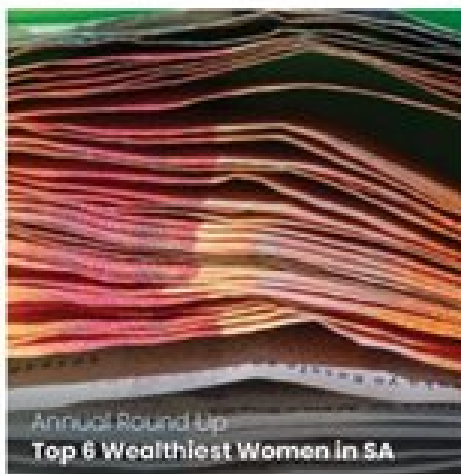
Annual Round Up Top 6 Wealthiest Women in SA