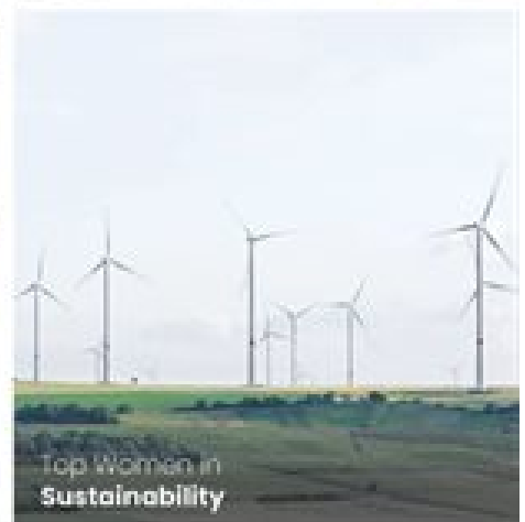
Top Women in Sustainability