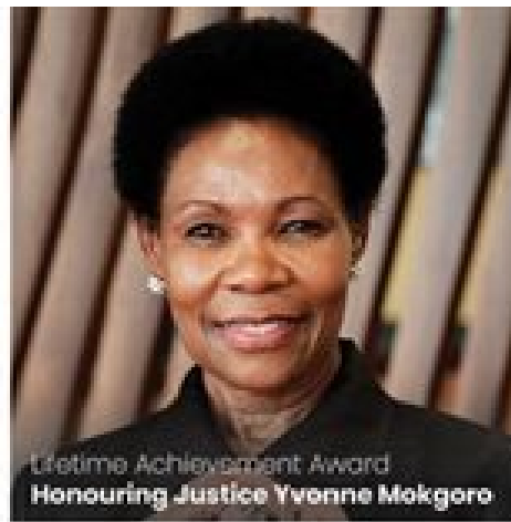
Lifetime Achievement Award Honouring Justice Yvonne Mokgoro