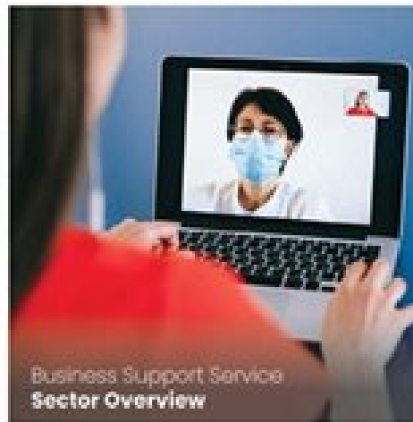
Business Support Service Sector Overview