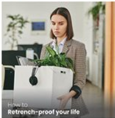
How to Retrench-proof your life