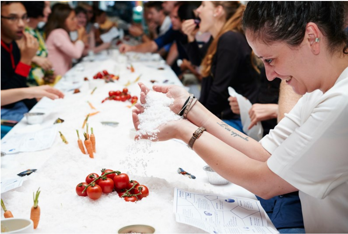
S/Zout Future Food pop-up waterless dinner