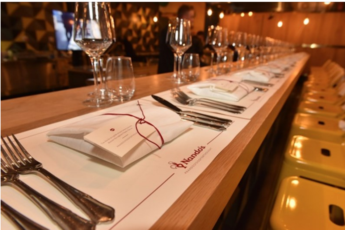
Nando's media dinner

Globally we're seeing a massive shift to experiential marketing because of the multisensory, immersive nature of experiences. Even digital brands are moving into the real world to create experiences. Google, for example, now hosts about 650 events a year in Europe alone.