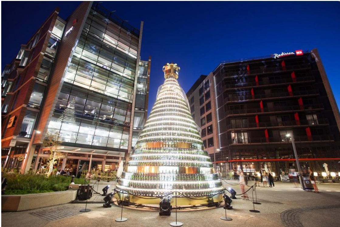
Moët & Chandon Champagne Christmas Tree

The social media-activated Moët & Chandon Christmas tree out of recycled champagne bottles just because it was so spectacular and the location right next to the Zeitz MOCAA in the V&A's Silo District was perfect!