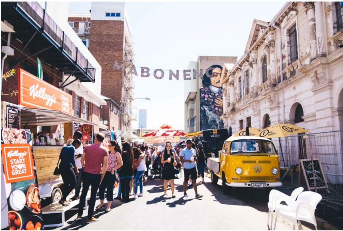
Street Food Festival